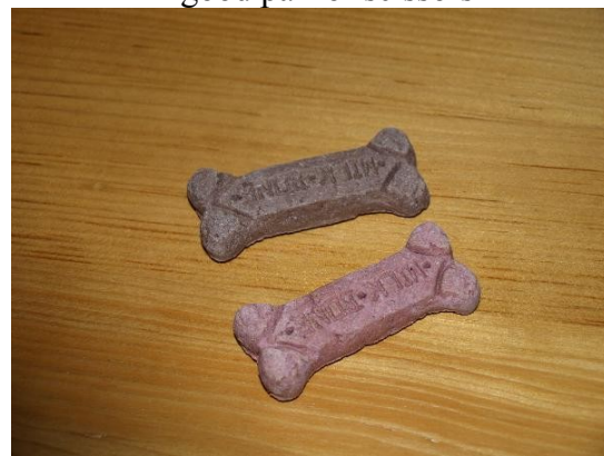
Treats for the puppy!