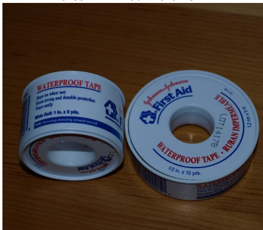
Waterproof adhesive tape in 1" and 1/2" widths