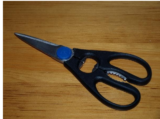
A good pair of scissors