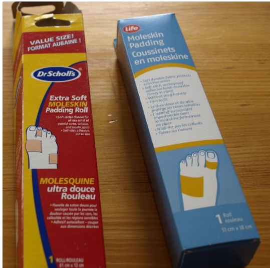
Moleskin – not MoleFOAM